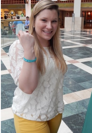
What Does It Mean to Fight Like a Girl? Personal Defense with Campus Police

Let's "Band" Together to Stop Sexual Assault