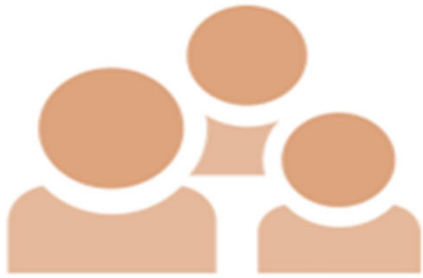
Anthology Blackboard Staff